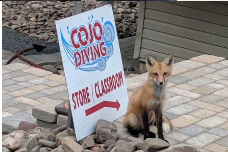
This one is from last month but I don't even care, he is so cute!!