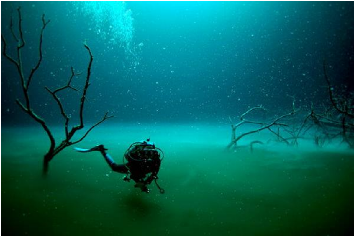
Cenote Angelita sea river near Tulum, Mexico