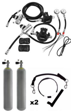
Complete Sidemount Packages