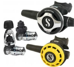
Cold Water Dive Packages