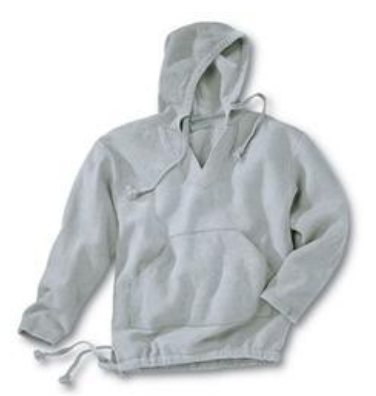
2 CLASSIC PULLOVER - $67.00