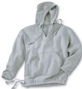
2 CLASSIC PULLOVER - $67.00