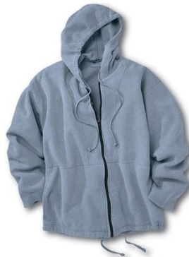
1 SURF BOMBER - $79.00